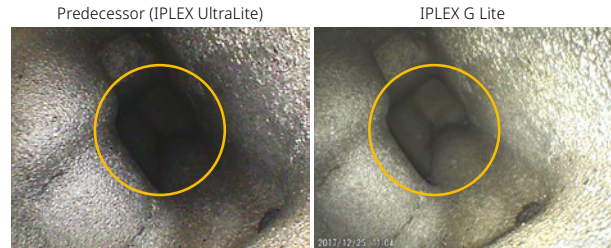
Bright illumination, even in large and deep areas

A noise reduction algorithm minimizes noise in dark videos and helps ensure accurate color reproduction.