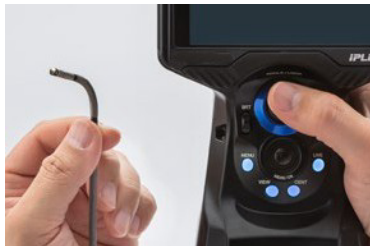
Image Capture Made Easy

The IPLEX™ G Lite video borescope's ergonomic design is complemented by TrueFeel™ articulation, making the joystick incredibly responsive. A light touch produces an immediate response and precise movement from the insertion tube so that it is easier to maneuver the scope.